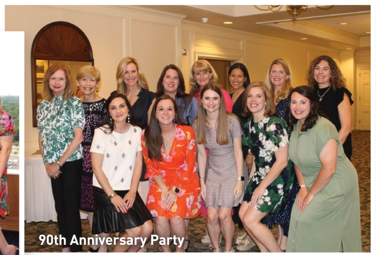
90th Anniversary Party

Thank you for all the ways you served and celebrated during the Junior League of Shreveport-Bossier's 90th Year!